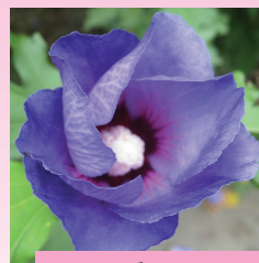
Azurri Blue Satin®