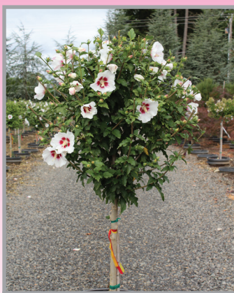
Red Heart #10 STD