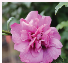
Boule de Feu